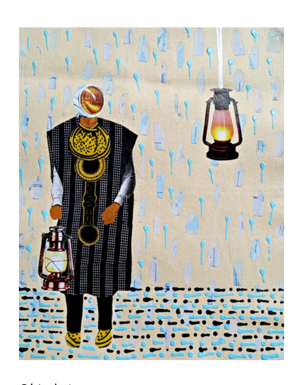
S'éclairer acrylic, fabric, and paperclip on canvas 38x30 cm 2022