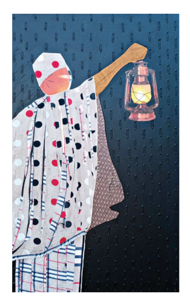
Lanterne de nuit acrylic, fabric, and paperclip on canvas 110x65 cm 2023