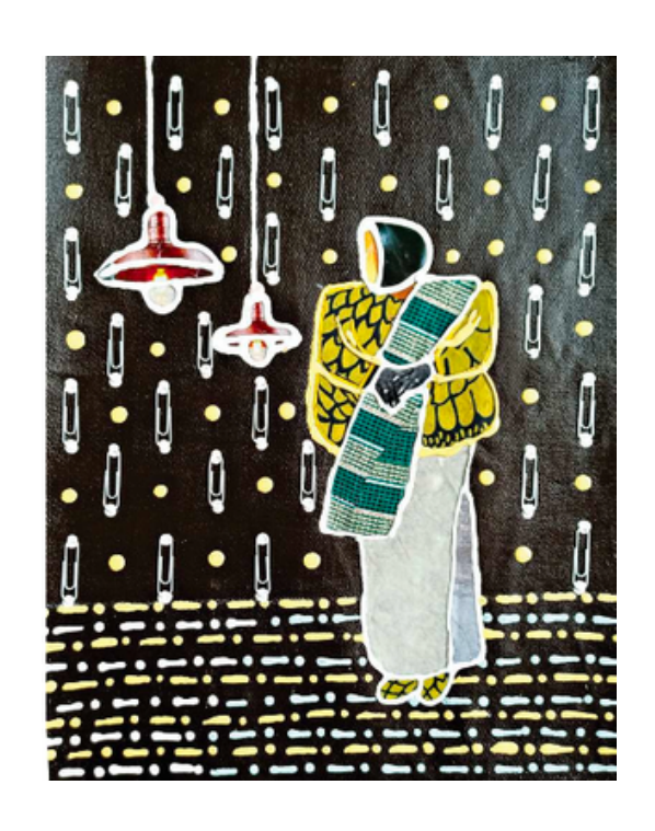
Vers la lumière

acrylic, fabric, and paperclip on canvas 38x30 cm 2022