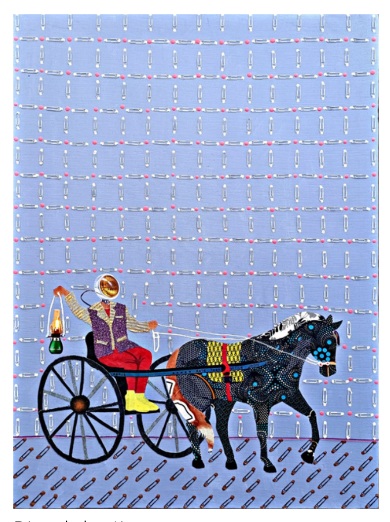
Rêve de lumière acrylic, fabric, and paperclip on canvas 103x75 cm 2022