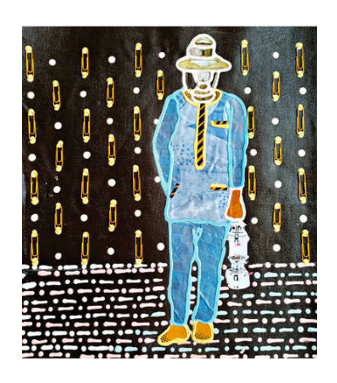
En marche acrylic, fabric, and paperclip on canvas 38x30 cm 2022