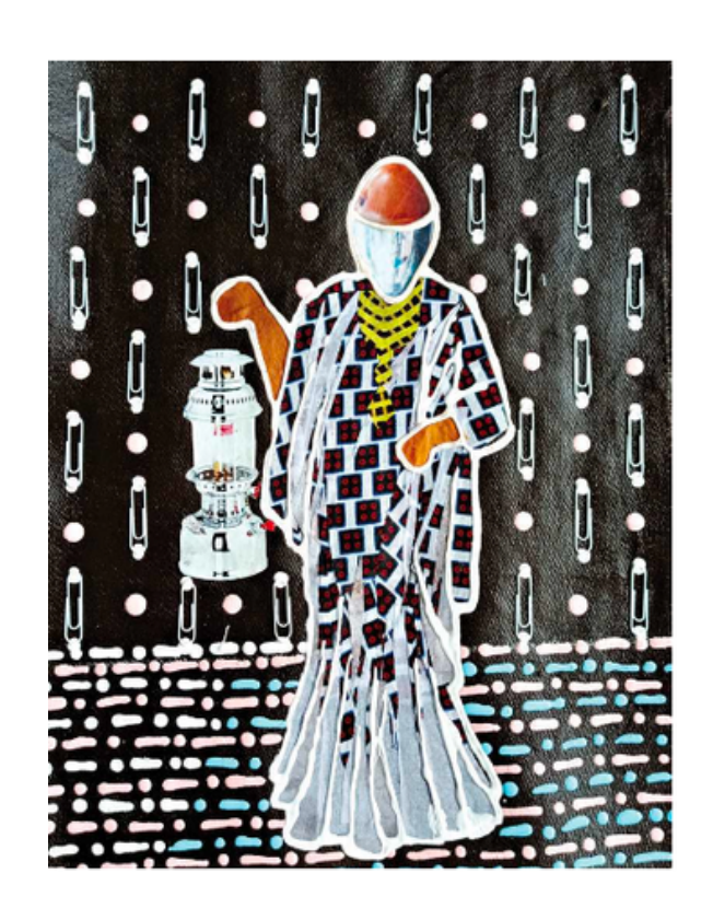
Femme de lumière

acrylic, fabric, and paperclip on canvas 38x30 cm 2022