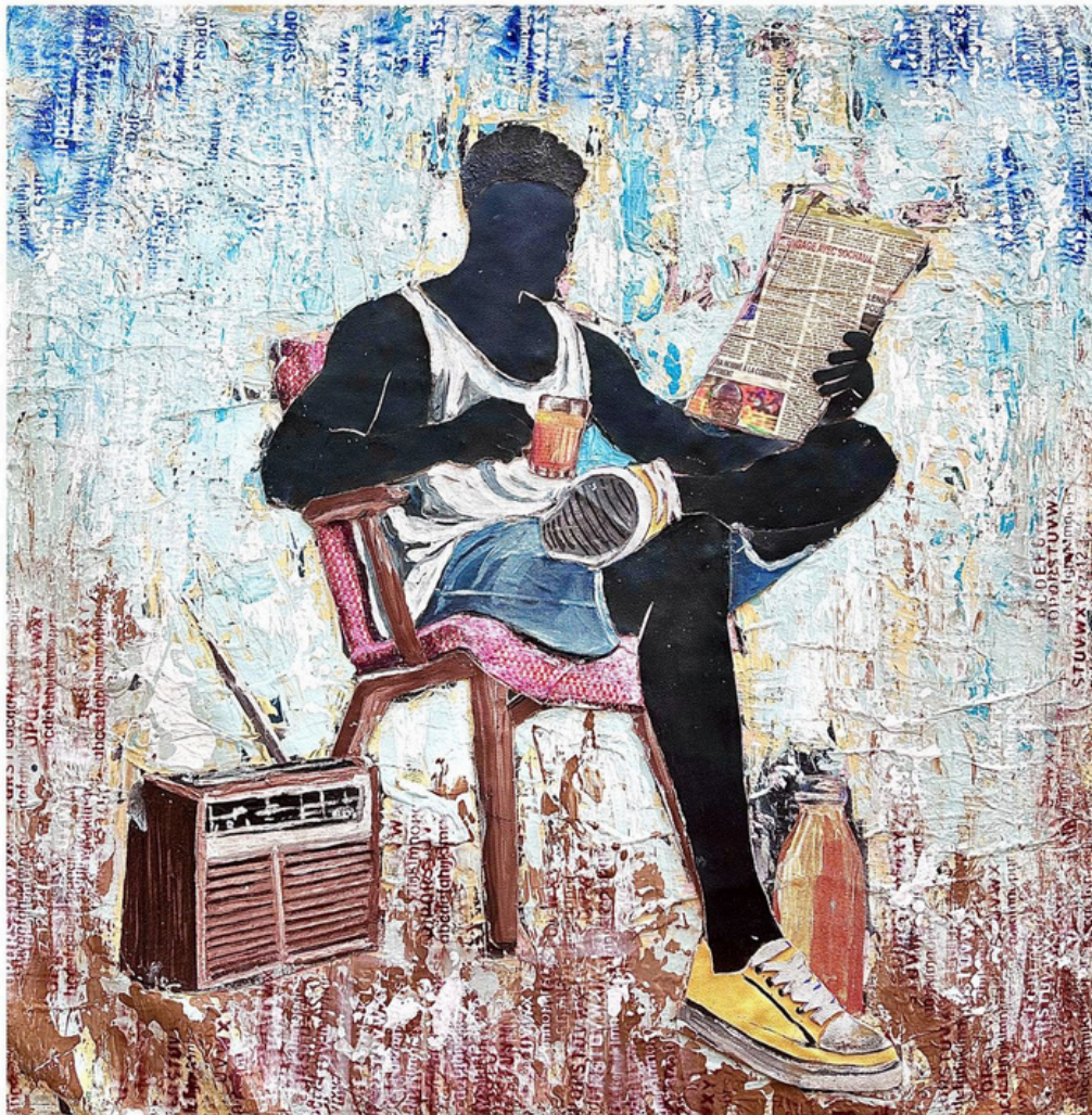
The street read too I ( La rue lit aussi I )

Mixed media, fabric collage, rice bag, leatherette, woollen thread, newspaper on canvas 100x100 cm