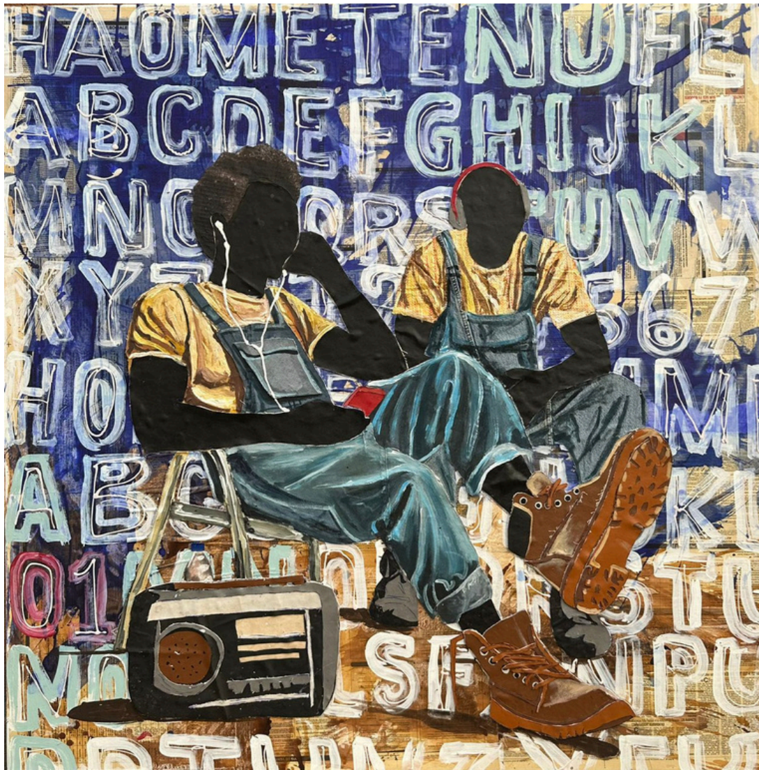
The street vibrate too ( La rue vibre aussi )

Mixed media, fabric collage, rice bag, leatherette, woollen thread, newspaper on canvas 150x150 cm