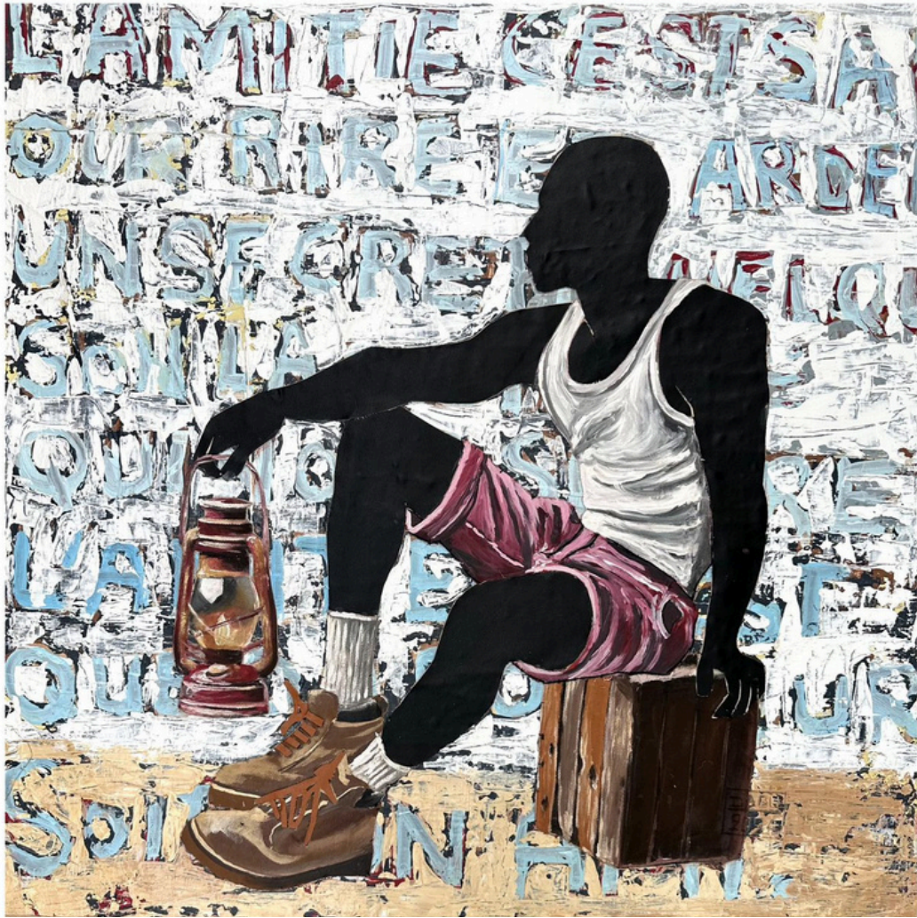
The street seek the light too I ( La rue cherche aussi la lumière I )

Mixed media, fabric collage, acrylic, leatherette, newspaper on canvas 120x120 cm