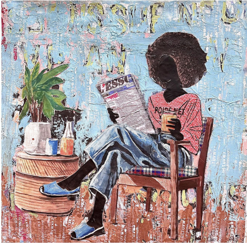
The street read too II ( La rue lit aussi II )

Mixed media, fabric collage, rice bag, leatherette, woollen thread, newspaper on canvas 100x100 cm