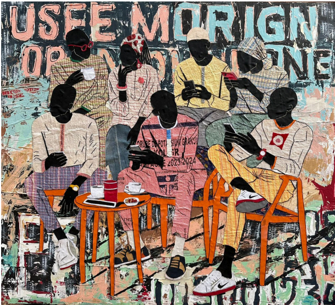
The street dream too ( La rue rêve aussi )

Mixed media, fabric collage, rice bag, leatherette, woollen thread, newspaper on canvas 200x180 cm